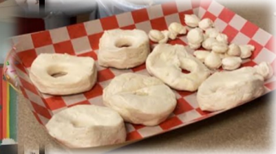
First grade culminated the folktale lesson featuring Little Red Hen and The Very Hungry Lion by learning about the origin of donuts and how they were made. Students ate donuts and used adjectives to describe them!